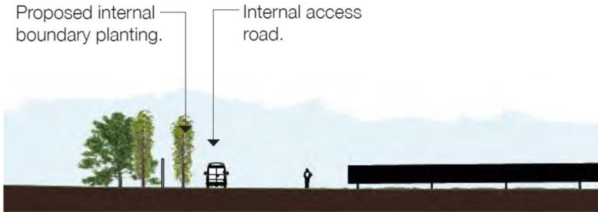
Figure 4-2 Section through solar farm, showing boundary planting (source Moir Landscape Architecture 2010b)